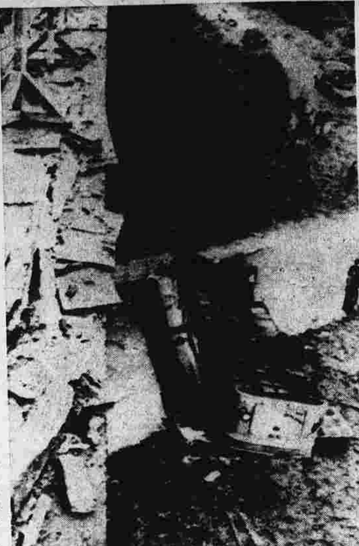
This bus, carrying children home from a summer camp, lies where it plunged off a bridge on the main Frankfurt to Cologne highway. The bus driver and 31 children were killed, several more seriously injured.

BRYAN, Ohio (AP)—The "Megtrans" may be around to stay. It flashed across the countryside Sunday at breathtaking speed, this jet-propelled experimental prototype, in concluding its initial tests by the New York Central System.